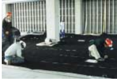
Luxury condominiums will have stained concrete finished floors.

Resonant Frequency - All materials have a resonant frequency - a frequency at which sound is amplified rather than filtered. The goal of any sound control mat is to lower the resonant frequency outside of the audible range (below 100Hz or above 3000Hz.) Enkasonic has been tested and rated with a resonant frequency of 46.8 Hz. Well below the audible level for all but the family dog!