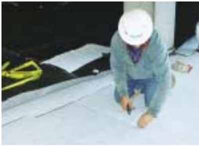
Preparing to complete installation of Enkamat 7918R over Enkasonic.